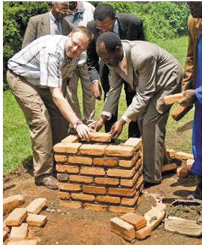
Laying the corner stone for Rwankeri.