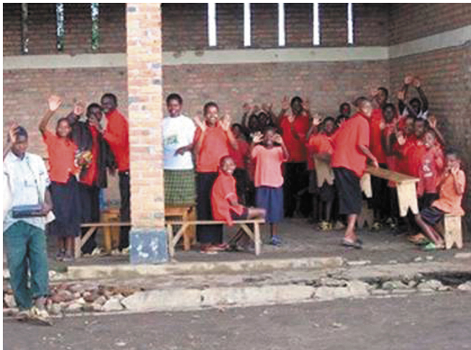
Opensided classroom at Umutara Deaf School.