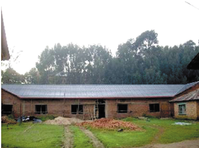
Rwankeri School New Dormitory.