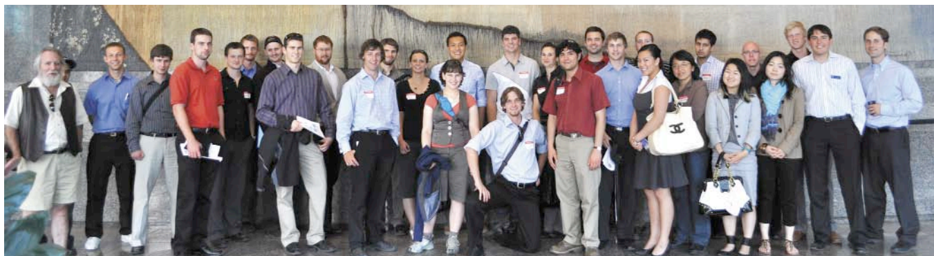
Group Photo: CSEG 2009 Student Fieldtrip: Participants and Organizers.