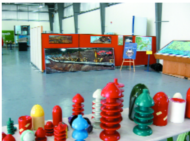
Some new displays in preparation for Project Discovery.