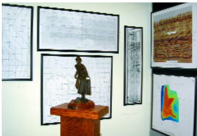
The present seismic display.