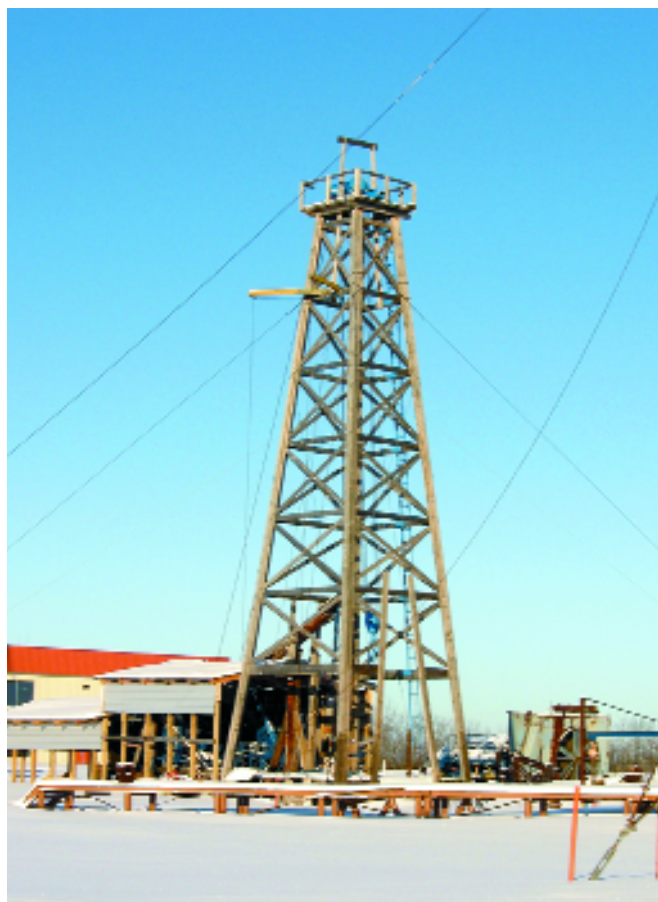
The Canadian Petroleum Discovery Centre is at the site of the Leduc #1 National Historic Site.