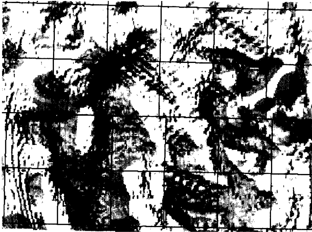
Fig. 1(a). Horizontal gradient of the total magnetic field from the GSC Cypress Hills data. Township overlay for scale.