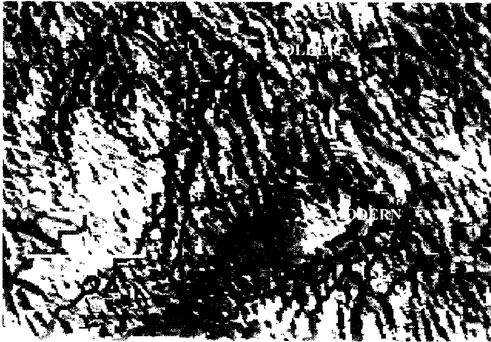
Fig. 2. Pseudo-depth Slice 1 showing comparison of older (unmarked) and modern drainage systems (green) – World Geoscience Rainbow Zama survey.

The first example is the Geological Survey of Canada's Cypress Hills survey from southern Alberta. The survey was flown at an 800 by 5000 metre line spacing and a 150 metre flight height. These data have been discussed widely in recent years and are the data chosen for study in many of the CSEG HRAM Forum papers.