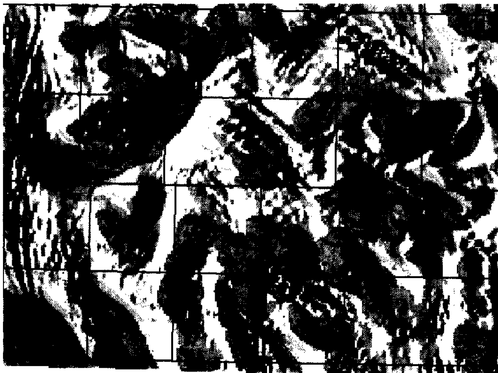
Fig. 1 (b). First vertical derivative of total field magnetics. GSC Cypress Hill data. Township overlay for scale.